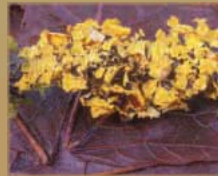
seaside kidney Nephroma laevigatum

◁ Seaside kidney fixes nitrogen. When the outer layers are eaten by animals, a bright yellow interior is revealed. ▷