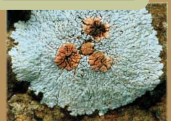
bullseye lichen Placopsis gelida