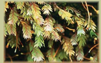
goblin gold Schistostega pinnata