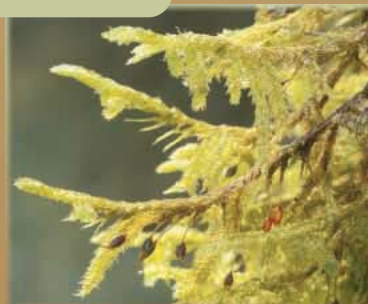
Douglas' neckera Neckera douglasii