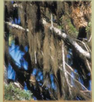
horsehair lichen Bryoria fremontii

▷ Native Americans made the poisonous horsehair lichen edible by steaming it in a pit oven for two days.