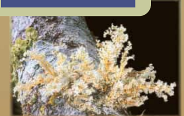
clustered coral Sphaerophorus globosus