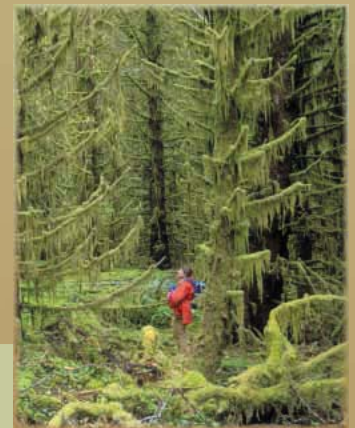
cat-tail moss Isoetecium myosuoides