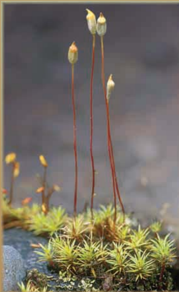
juniper haircap moss Polytrichum juniperum

Lichens are grouped into three categories of shape: foliose (leaf-like), fruticose (shrub-like), and crustose (growing closely attached to a surface).