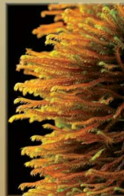
common scissorleaf Herbertus aduncus