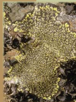
map lichen Rhizocarpon geographicum