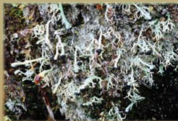
northern fan coral Bunodophoron melanocarpum