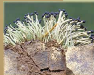
Devil's matchstick Pilophorus acicularis