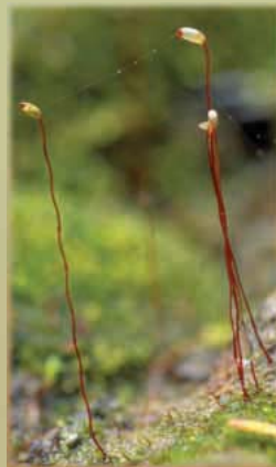
flag moss Discelium nudum