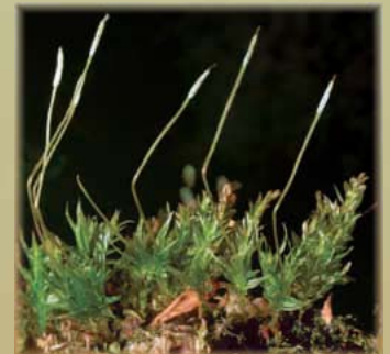
bent-kneed four-tooth Tetraphis geniculata